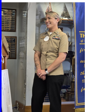
Coronado Rotary recognizes ___ as Sailor of the Year